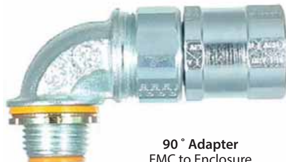
90° Adapter FMC to Enclosure Made in the USA